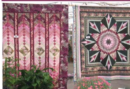
Over 100 Exceptional Local Hand-made Quilts