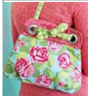
Bella Bag Bev Bayliss $36

Make yourself a Bella Bag using up-scale details such as grommets, buttons and handle shaping. Choose from three different size options and several different handle and interior pocket options. Ort. Wed Sept 1 7-8 pm & Sept 8 & 15 7-9:30 pm OR Ort. Thurs Sept 2 9:30-10:30 am & Sept 9 & 16 9:30-noon.